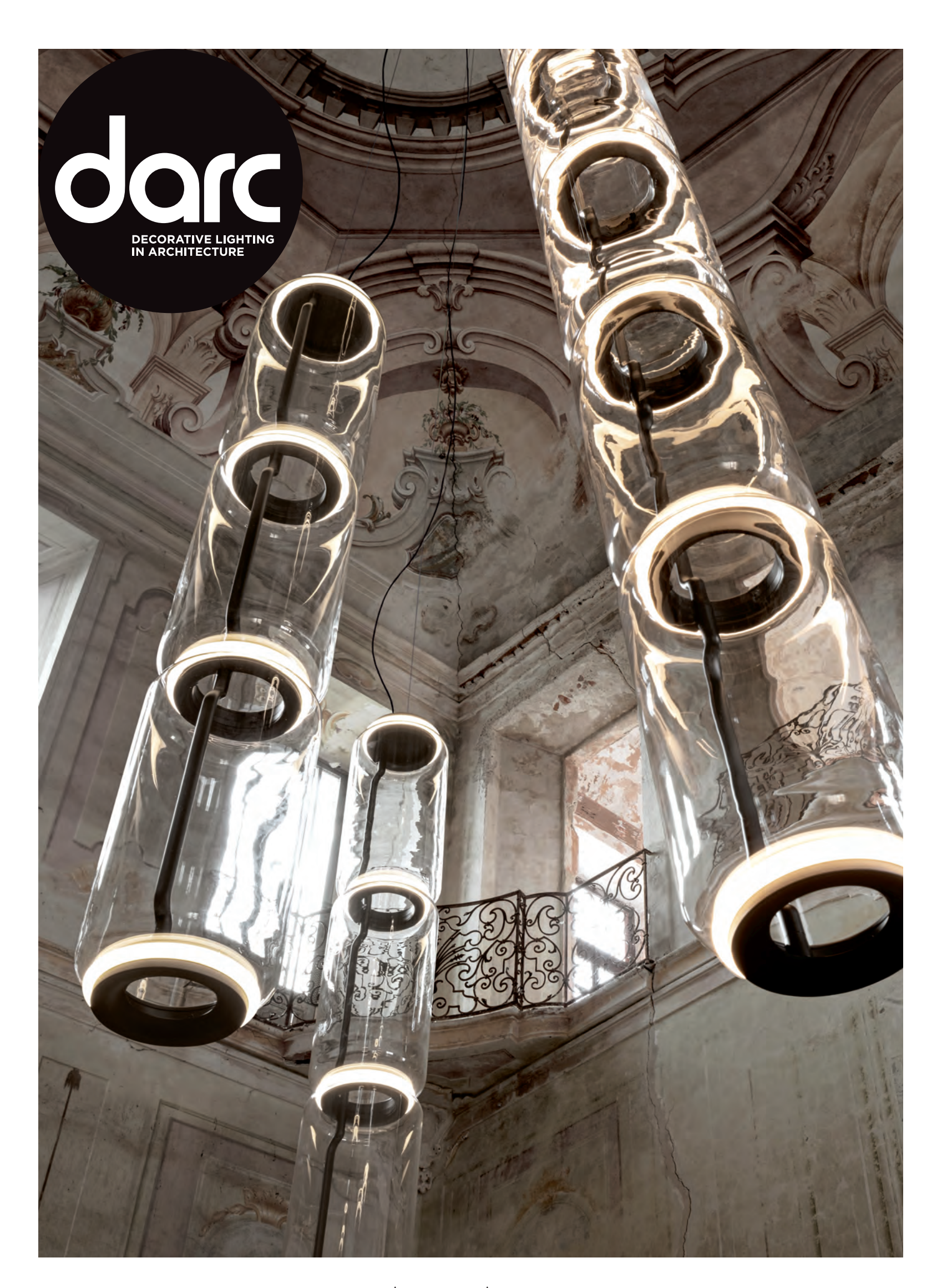
25hours Hotel | Flos | Silver Lining Diner